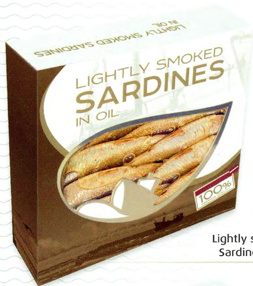
Lightly smoked Sardines in oil 120 g