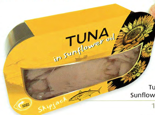
Tuna in Sunflower oil 120 g