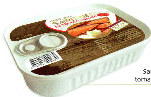
Brisling Sardines in tomato sauce 100 g