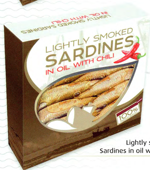
Lightly smoked Sardines in oil with chili 120 g