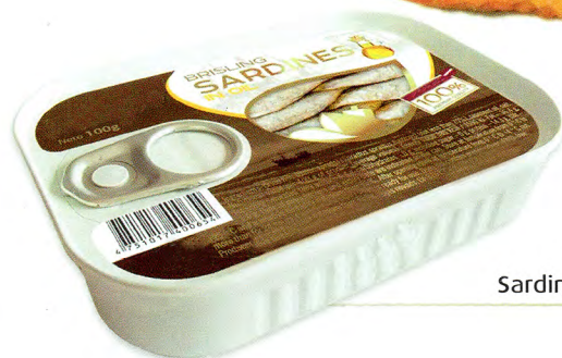
Brisling Sardines in oil 100 g